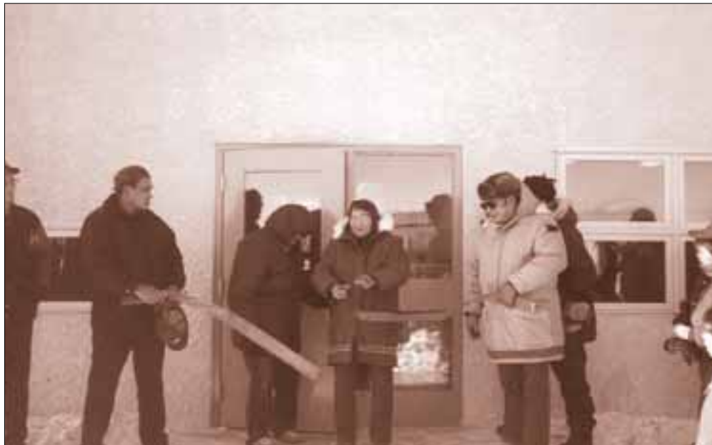
Chief, Councillors and Elders cutting the ribbon at the opening of the new band office.