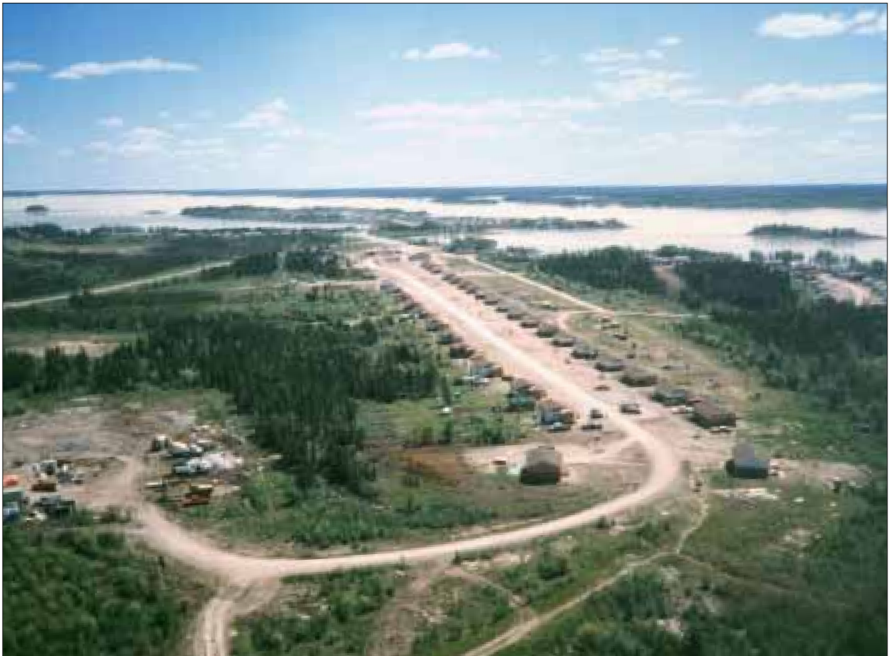
Today, Split Lake is a thriving community of nearly 1700 people.

Overseeing all of these activities, with strict accountability to the people, Chief and Council today perform the legislative functions of a much more complex government. Even here traditions are maintained, as bi-annual elections continue to return a Council which is broadly representative of both the family and age groups in the community.