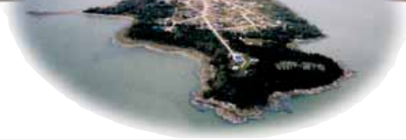
Split Lake peninsula in 1927 (above) and in 1990 (inset).