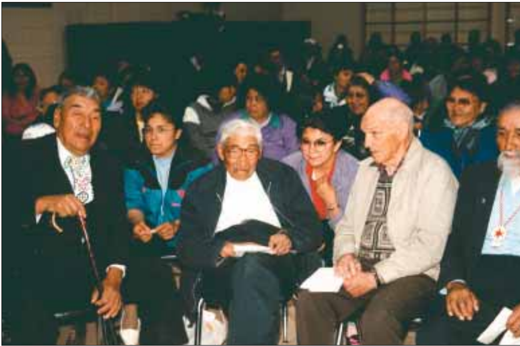
Split Lake Elders and other members at the 1992 signing ceremony for the Split Lake Implementation Agreement.