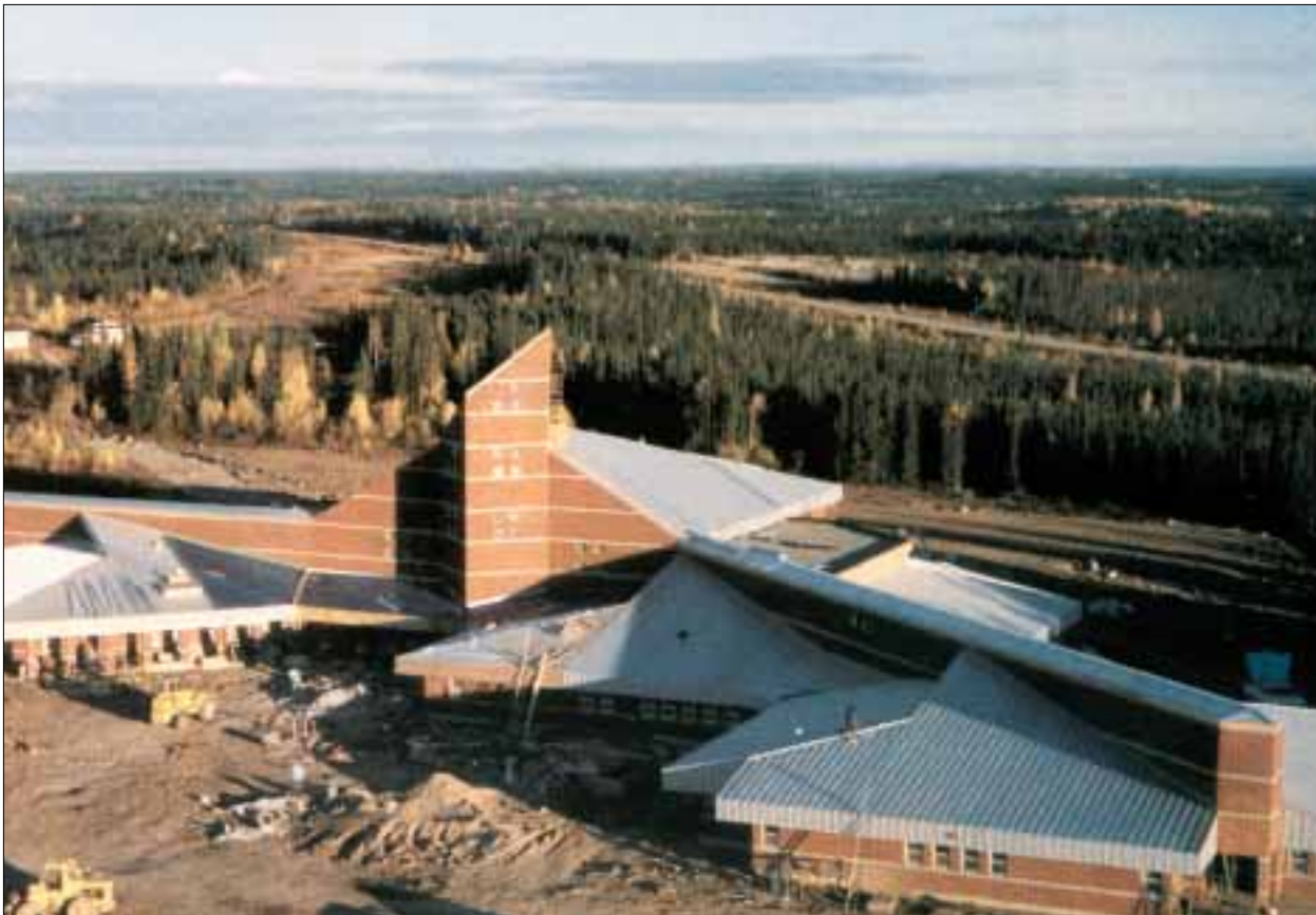
Construction of the 50,000 sq. ft. Chief Sam Cook Mahmuwee Education Centre in Split Lake.