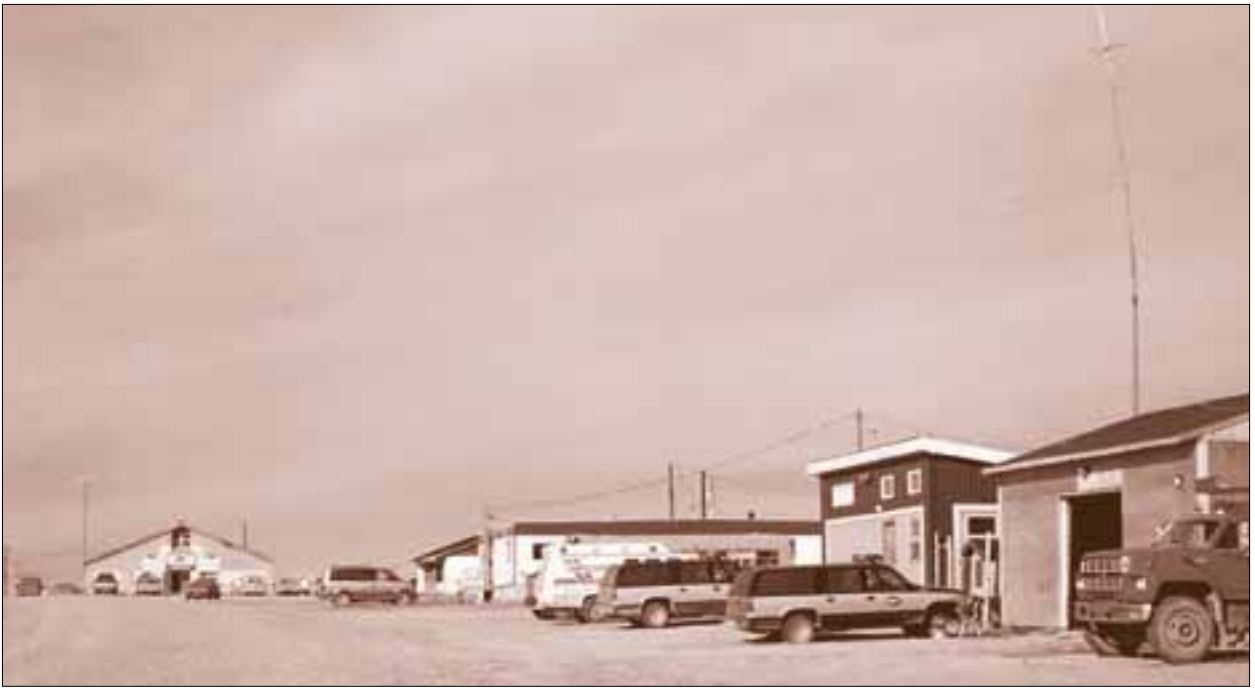
Split Lake 'New Core' showing band office, Tataskweyak Trust office and security office.